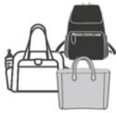
NO PURSES, BACKPACKS, & DIAPER BAGS