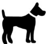
NO ANIMALS EXCLUDING CERTIFIED SERVICE ANIMALS