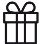
NO WRAPPED GIFTS

All carried items and entrants are subject to search. Prohibited items must be returned to the owner's car or discarded. Any unlawful items are subject to confiscation, and the person in possession of such item is subject to arrest. Items left at the door will be discarded.