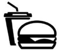
NO OUTSIDE FOOD OR BEVERAGES