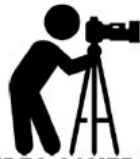
NO VIDEO CAMERAS OR CAMERAS WITH LENSES GREATER THAN 6"